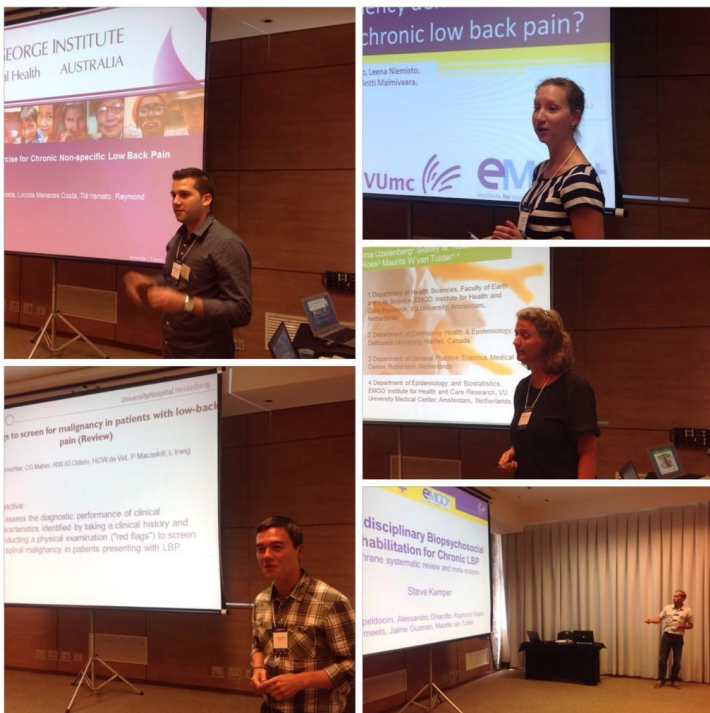
CBRG Pre-conference attendees, Campos do Jordão, Brazil, September 2014.